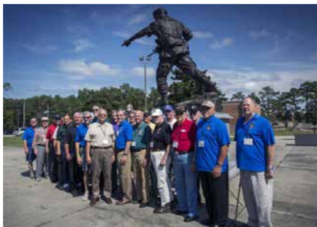
"Green Berets Making America Great!"