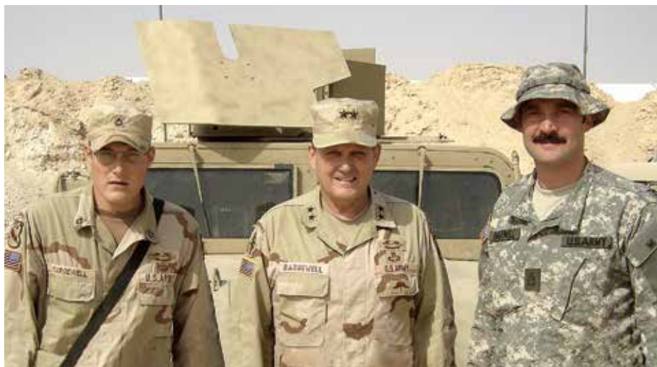
Three Bargewells in Iraq.