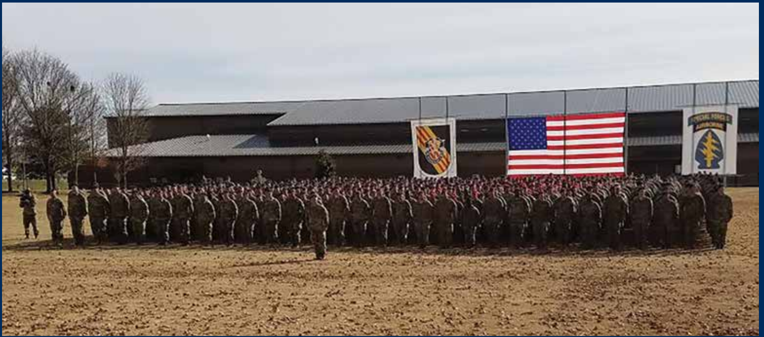
ABOVE: Entire 5th Group (minus those deployed) stand at attention