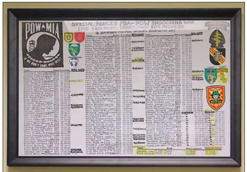
5th Group's display honoring Special Forces Indochina War POW and MIA's.