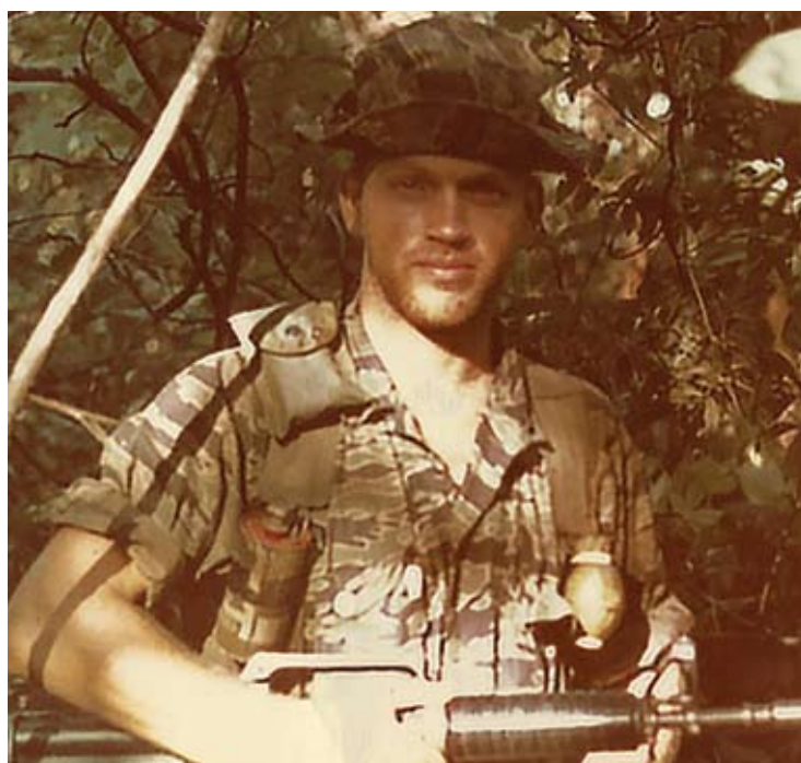
A photo of the author as a young man. August 1969.