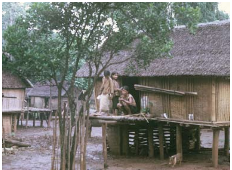
Montagnard village 1969

unsuccessful. For two weeks the GVN officials fretted about what to do, but finally on 13 April 1970 sent out a company of Regional Force (RF) troops to find the villagers. Within a few days about 2,500 villagers drifted back to Plei Doch, but they noted upon their return that when the VC and NVA moved away from the area, they had taken all the young men and women between the ages of 14 and 20 years with them "over the river" to Base Area 702 in Cambodia. The returning villagers attempted to resume the precarious life they led at Plei Doch, but VC and NVA pressure were a threat that remained constant. Worse was to come.