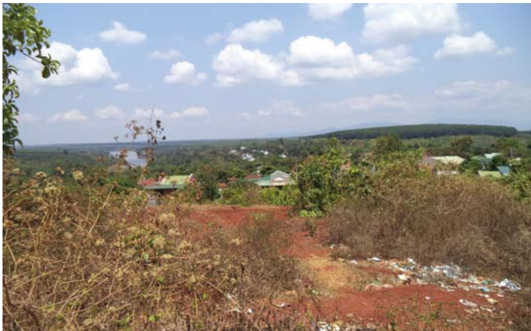
Modern shot of Plei Doch, April 2014. This photo was taken at about the same spot as was photo #1, 45 years earlier