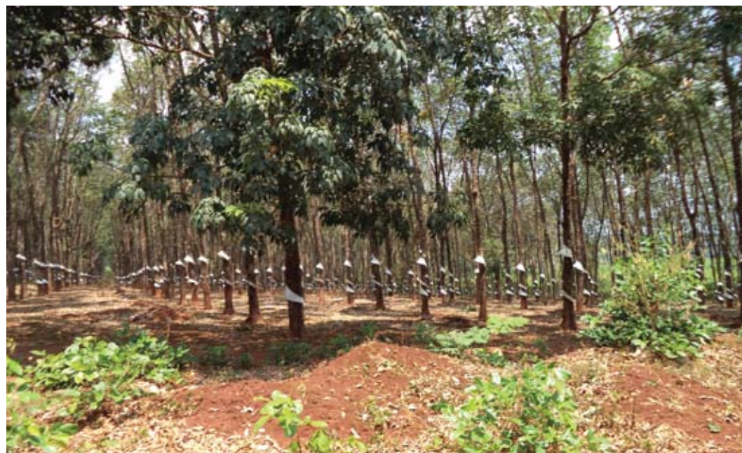
Modern rubber plantation near former Plei Djereng, April, 2014.