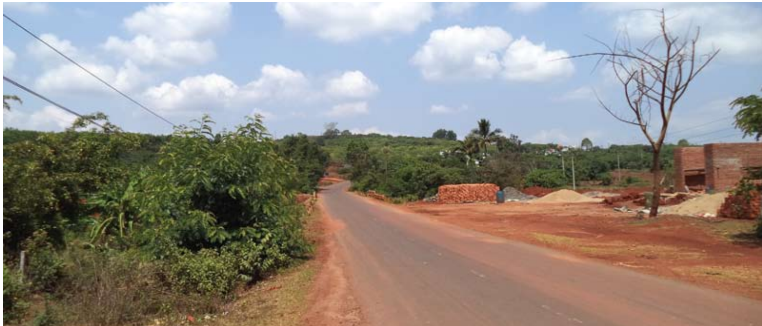
Modern view of Plei Djereng hill, April, 2014, looking west. Note PAVN radio antennae on left side of hill crest.

highlands. Vietnamese businessmen were allowed to claim land and establish private coffee and tapioca plantations. Montagnard claims to the land generally were ignored, but they were offered employment on the plantations, working alongside Vietnamese newcomers. Montagnard villages often were destroyed and the residents forced to move into Vietnamese towns that began to flourish along the roadways throughout the highlands. The SRV also has instituted a system of forced assimilation, refusing to teach any of the montagnard languages in school and forbidding the montagnard men to wear loincloths. Over the years there have been occasional montagnard demonstrations against Vietnamese policies, but these have been quickly and thoroughly put down. There is little chance these policies will be reversed.