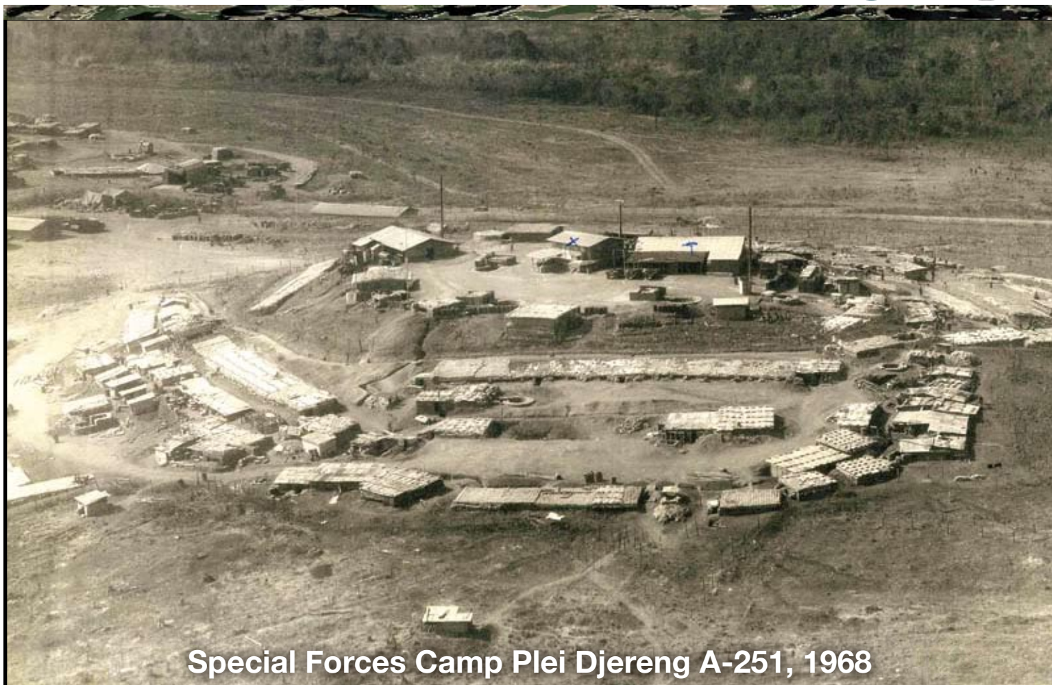
Special Forces Camp Plei Djereng A-251, 1968