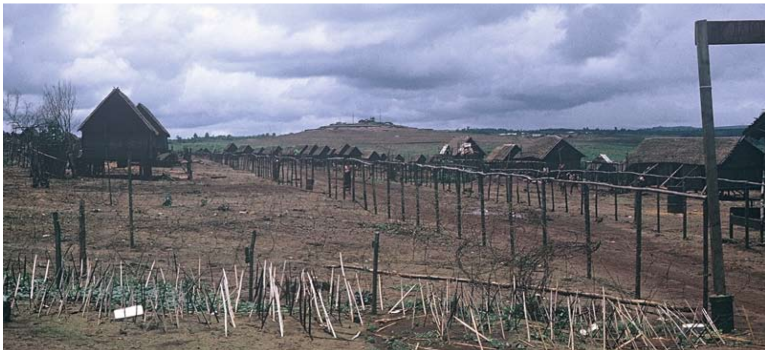
Polwar compound at west end of Plei Doch, with Plei Djereng in the distance. July 1969.

In October 1969, while one of Plei Djereng's line companies was on a joint operation with elements of the US 4th Division against entrenched NVA forces in the Plei Trap Valley northwest