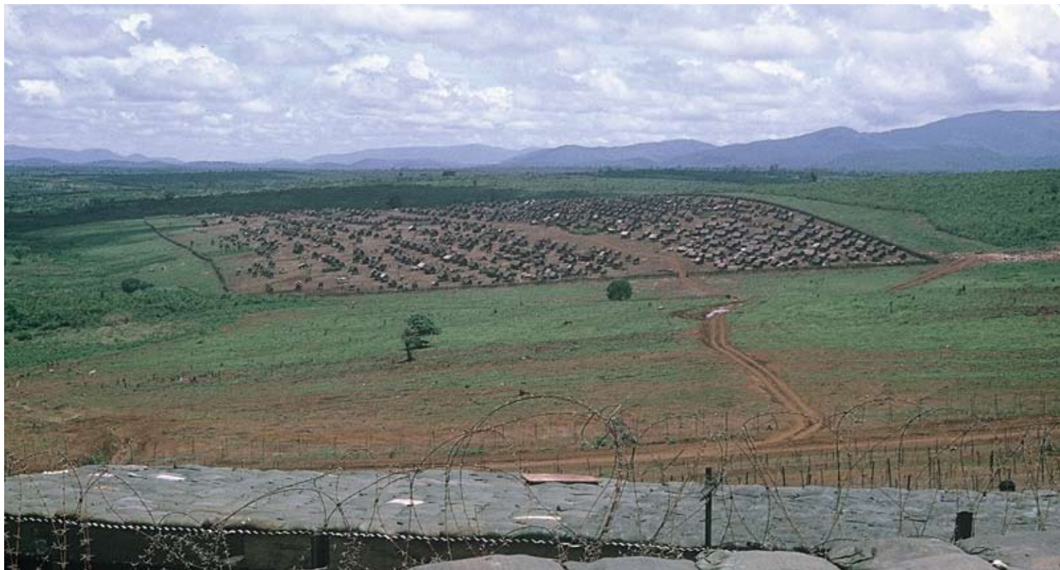
Plei Doch village seen from USSF Plei Djereng team house, July 1969.

cardinal directions around the hill, providing 360 degree line of sight to the countryside beyond the defensive wire. Members of the camp strike force were urged to move their families into the camp, and most took advantage of the relative safety offered by these reinforced accommodations.