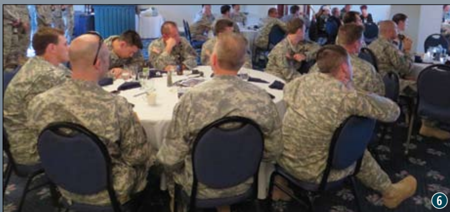
① Members of Company A, 19th Special Forces Group (A)