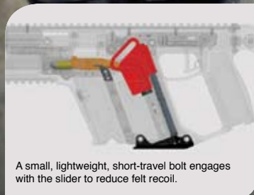
A small, lightweight, short-travel bolt engages with the slider to reduce felt recoil.