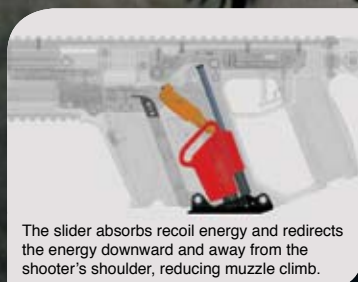
The slider absorbs recoil energy and redirects the energy downward and away from the shooter's shoulder, reducing muzzle climb.

The KRISS Vector .45 ACP SMG utilizes the patented, recoil mitigating KRISS Super V System. Designed for the 21st century shooter, this unique system reduces felt recoil by as much as 60% and muzzle climb by 95%. It allows shooters to get on target faster and stay on target, even when operating in fully-automatic fire at 1,200 rounds per minute.