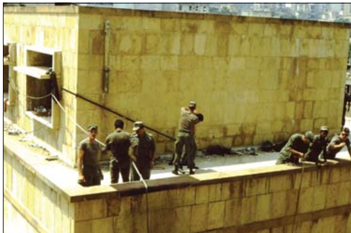
Rappelling class from the top of the Cadmos Hotel