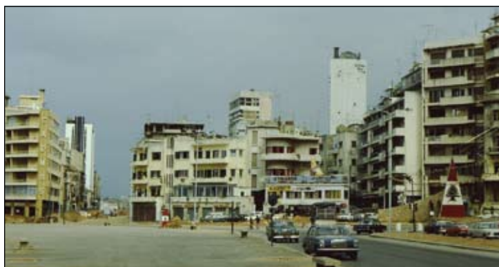
The Cadmos Hotel, on the far left, in West Beirut.

The Hotel Cadmos which would be home to MTT 3 was a five story structure with underground parking. Not a five star hotel, it was however much nicer than the quarters of the Marines at the Beirut Airport. The hotel was also prepared for combat having an