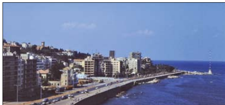
View of the Mediterranean Sea from atop the Cadmos Hotel.