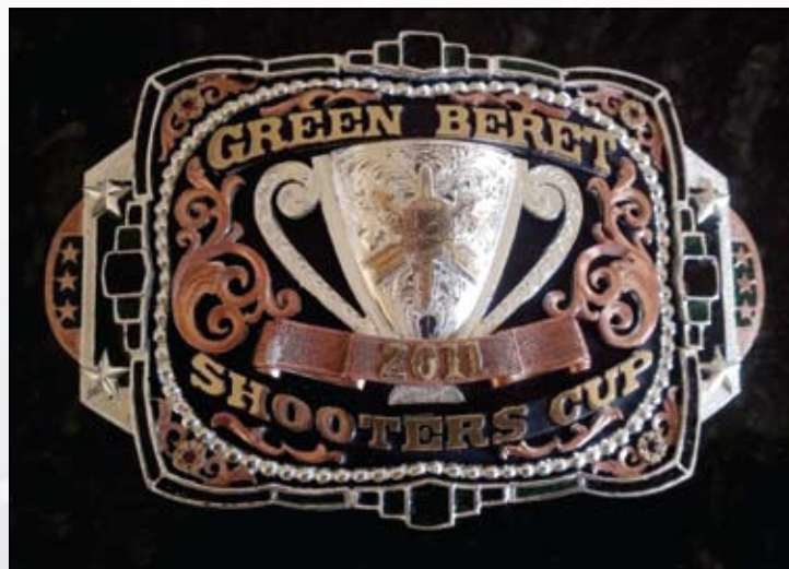
"Green Beret Shooters Cup Championship Belt Buckle." Possible prize for the 2013 winning team, designed from major cowboy rodeo championship belt buckles. Date to be adjusted.

The picnic will kick off at 1300 with a demonstration jump by the Special Forces Association Parachute Team.