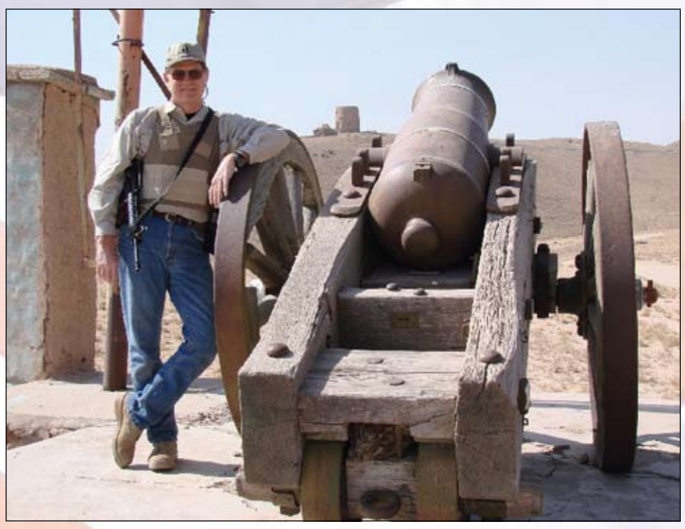
1-0 RT Delaware, second war, new and old weapons, Afghanistan