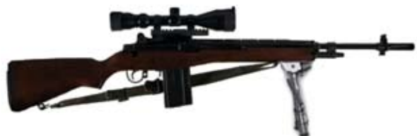
Springfield M1A With Scope and Bipod