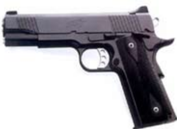
Kimber .45 Custom II

Visit our booth at the Gun Show for a chance to win: