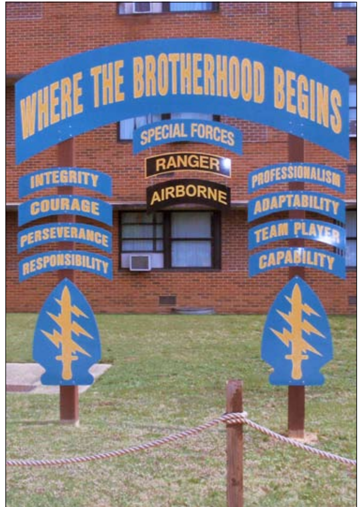
SF Creed at Fort Bragg.