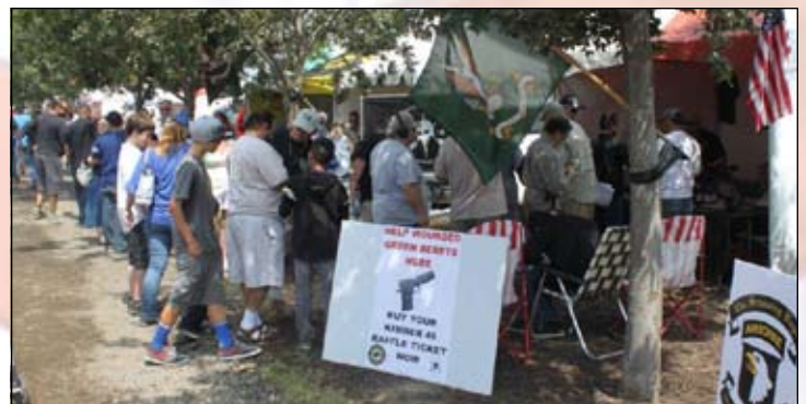
Our booth was always busy.