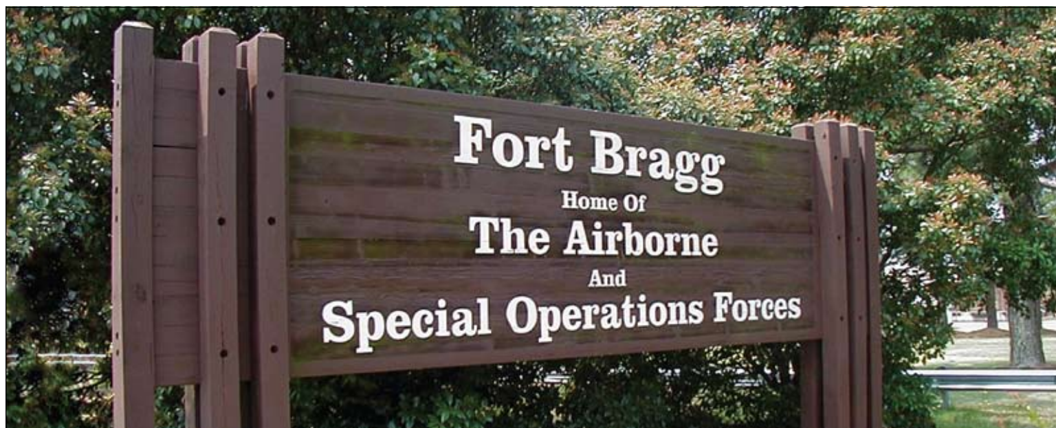
A sign at one of the entrances to Fort Bragg, the location of the SFA 2012 Convention.

Overall, the most important feature of the convention was the meeting of former team mates, old friends, new friends and the resulting comrade – no convention features or events can match that interaction of friendship. In 2013 the convention venue is San Antonio, TX and in 2014 its in Columbia, SC. ❖