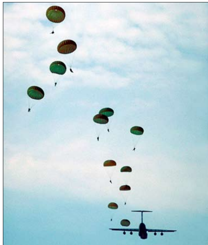
US Army paratroopers at Fort Bragg.