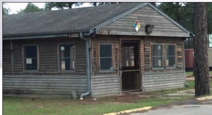
Last original building at Camp Mackall.