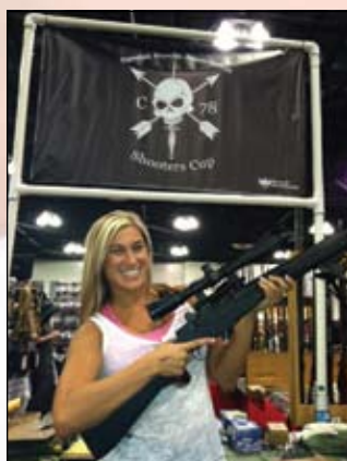
M1A1 Springfield cal .308 rifle at Gun Show. Chapter 78 raffle.