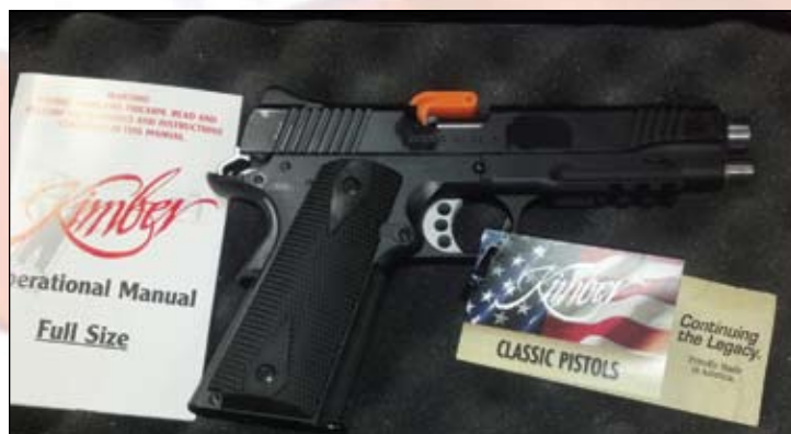
Kimber for Green Beret Raffle, 2012

development of an ad in the June Sentinel on corporate sponsorship. Corporations may donate items from their product lines as prizes for our competitors or (Continued on page 3)