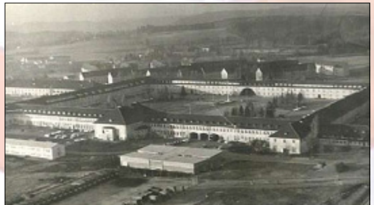
Flint Kaserne, Germany, home of the 10th SFG(A), 1953 to 1990s.