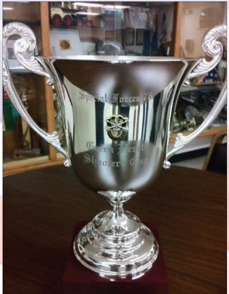
Special Forces Green Beret Shooters Cup trophy