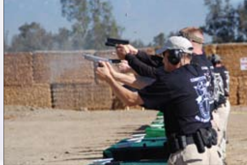
Shooting after pistol assembly and running