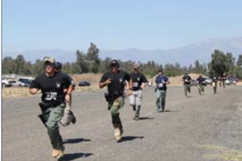
Quarter mile run