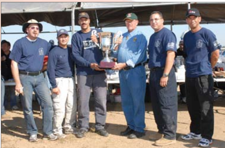
Colonel Roger Donlon presenting LAPD Blue the Green Beret Shooters Cup Trophy.