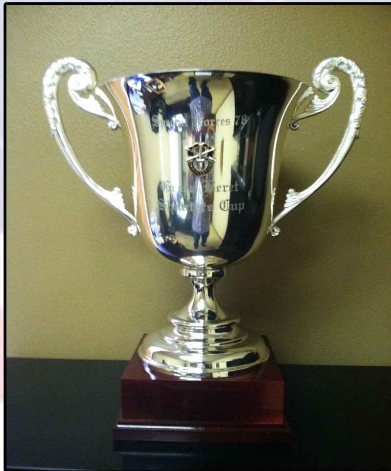
Special Forces Association Chapter 78 “Green Beret” Shooters Cup.