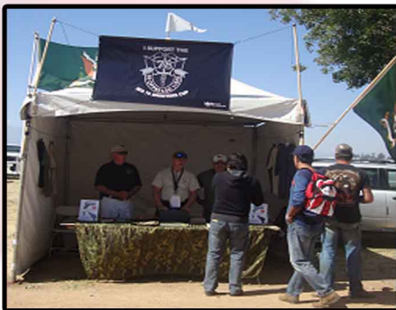
SFA 78 Booth