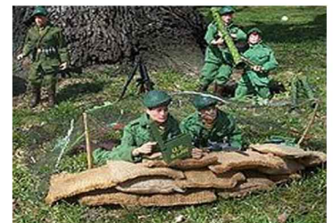
Green Beret GI Joes