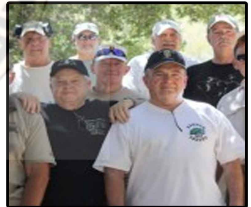
Chapter 78 Members at last years Day at the Range