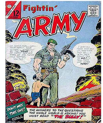
Fightin' Army Comic Book 1966

Robin Moore also wrote a 1965 Tales of the Green Beret newspaper comic strip with artwork by Sgt. Rock (comics) Joe Kubert that was also published in paperback. It later became a Dell Publishing American comic book in 1967 replacing their earlier Jungle War Stories and Guerrilla War comics. When DC Comics's Larry Rock (brother of the Sergeant), the replacement in Our Fighting Forces for the Marines Gunner and Sarge and their dog Pooch proved unpopular, DC replaced him with a Green Beret named Captain Hunter in 1966. Captain Hunter's adventures featured him hunting for his twin brother, a pilot shot down and captured by the Viet Cong. Other war comics put in their own Green Beret characters, such as Lightning Comics' Todd Holton-Super Green Beret.