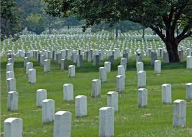
Arlington National Cemetery