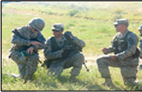
"Up and Coming Leaders"