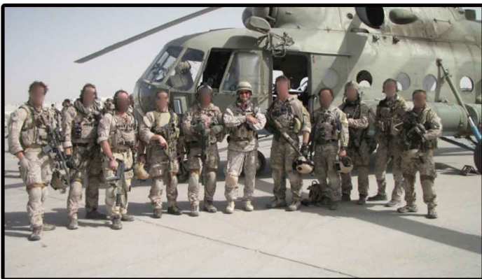
Navy DEVGRU Team in Afghanistan

• One chopper is said to have "stalled" above the compound. NBC reports that the chopper stalled because of a lack of air due to the high walls of the compound. Other theories are that it hit something or was shot down. In any event, the SEALs abandoned it and conducted the raid.