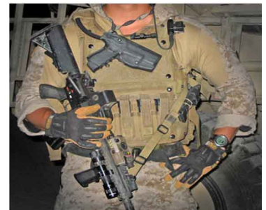
SEAL Team Personal Kit