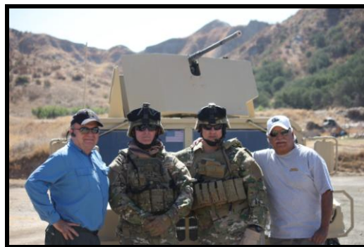
SFA Members on set of “The Ripple Effect”