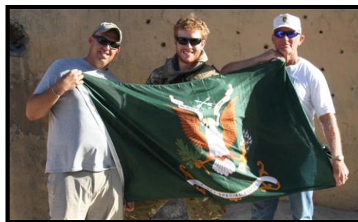
A Tribute to Special Forces