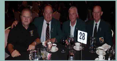
Chapter 78 members attend the SOAR 2010 Banquet