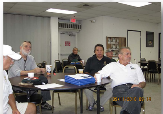
Chapter 78 members enjoying a great meeting.