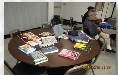
Table of Raffle prizes