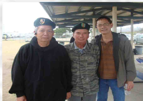
Chapter 78's Vietnamese Counterparts