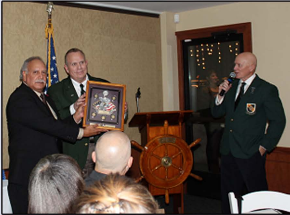
Man of the Year Award