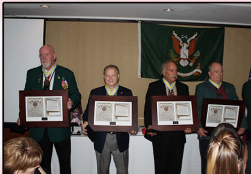
Order of St. Maurice Awardees