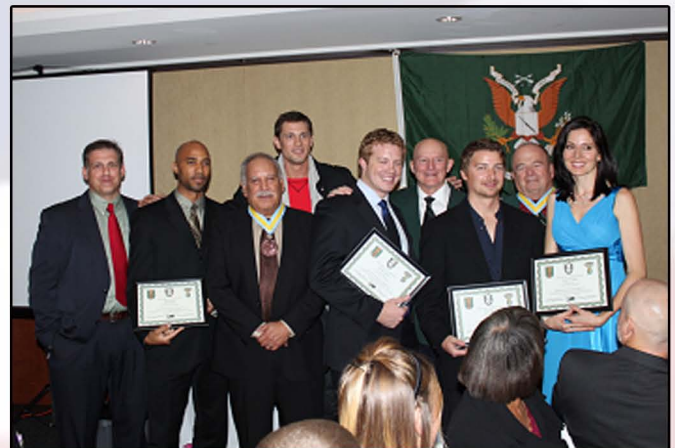
The Ripple Effect cast receiving Chapter 78 Honorary Memberships